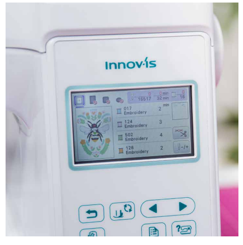
On-screen editing capabilities