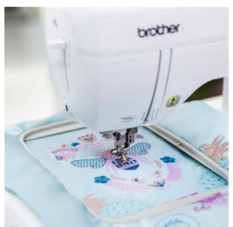
Eye-catching built-in embroidery designs